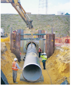
c. Installation of MSCL Pipe

• Close cooperation and interaction between the client, designer, pipe jacking